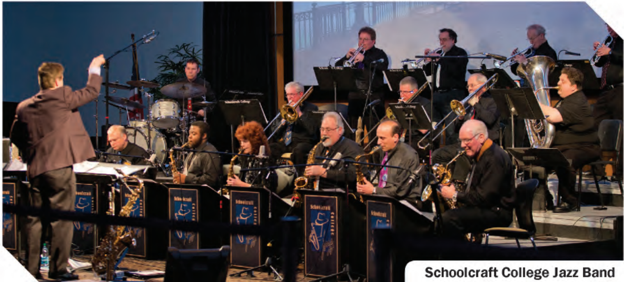
Schoolcraft College Jazz Band